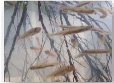
Ngā Puna Manaaki Īnanga